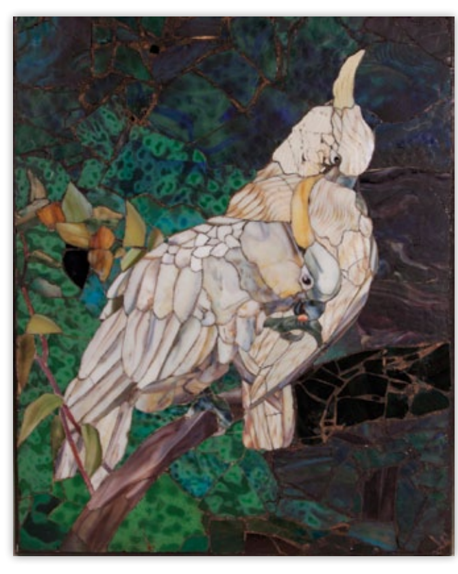
Tiffany Studios, Mosaic Panel with Sulphur-Crested Cockatoos, American circa 1908 22" high, 17 34" wide